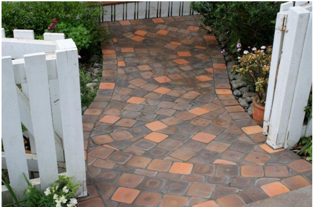
Cottage Entrance using Antique Cobbles