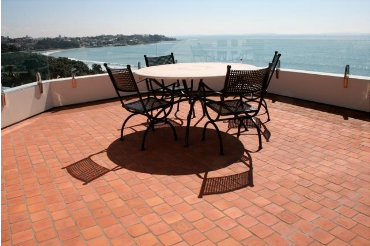
Patio using Akaroa Squares